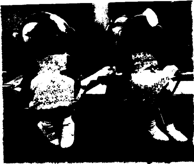
My Twin Daughters