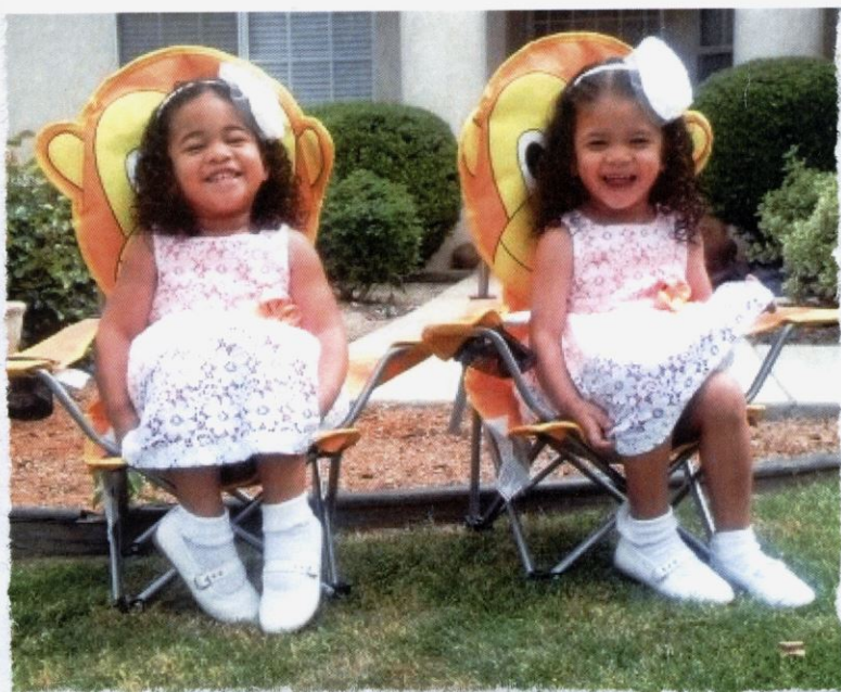
My Twin daughters